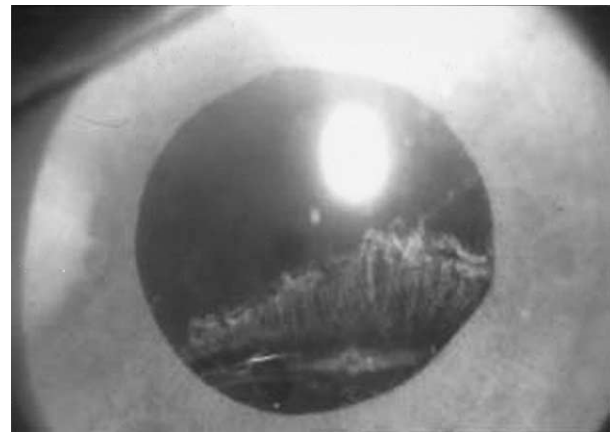
FIGURE 2. Case 3: patient with history of "eye rubbing." The torn zonules are visible in the visual axis and edge of intraocular lens at inferior pupil border.